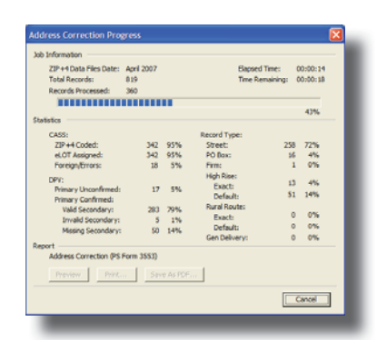
Mailroom certifies your addresses, prints required USPS reports, prints tray and mailing labels. Not only does Shelby Mailroom save you money, it actually pays for itself!