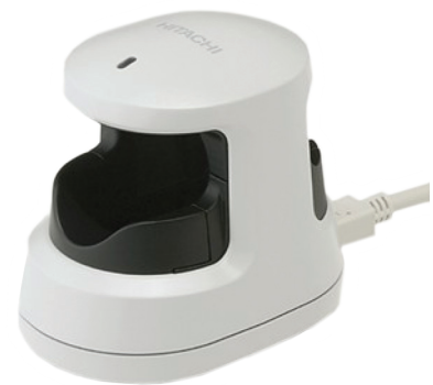
M2SYS Vein Reader